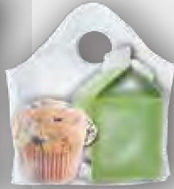
F12CC - Small Snack Meal Bag