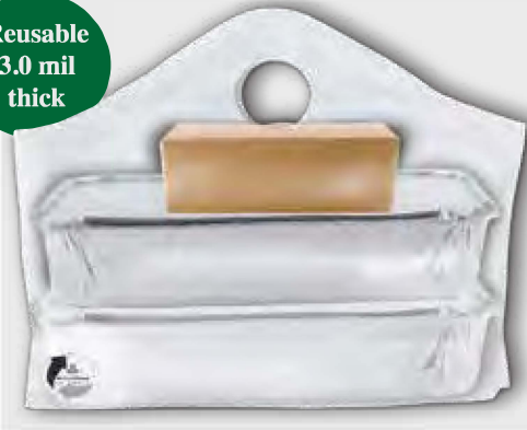
F34RU Jumbo Catering Bag fits two full size steam pans (25% PCR)