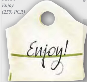
White Super Wave Bags