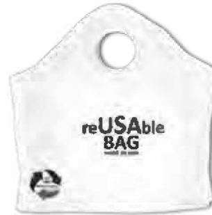
F18RP Reusable Super Wave (25% PCR)