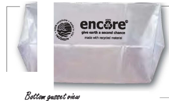
Bottom gusset view