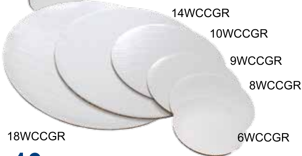
14WCCGR 10WCCGR 9WCCGR 8WCCGR 18WCCGR 6WCCGR