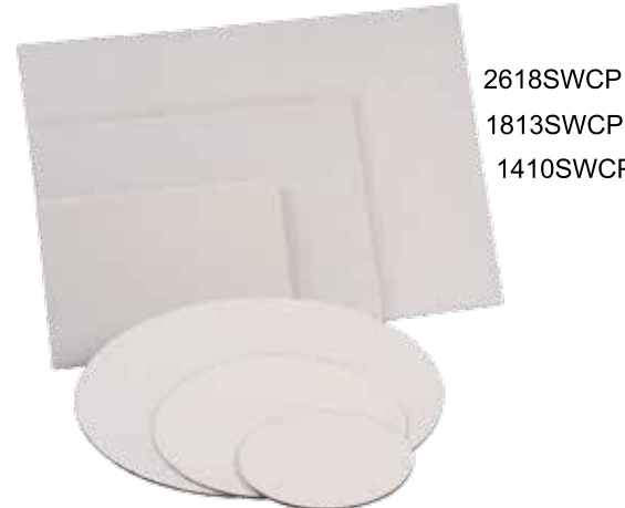
2618SWCP 1813SWCP 1410SWCP