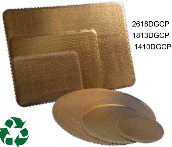
2618DGCP 1813DGCP 1410DGCP